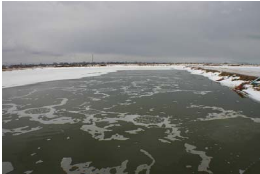
Effective in cold weather

Ammonia is a common wastewater contaminant. The chart to the right shows effective ammonia removal under test bed conditions using aerated bio-domes . Bio-domes can also reduce BOD, TSS and Total Nitrogen levels. The chart also shows water temperatures during the tests. Bio-domes are able to effectively remove contaminants under cold weather conditions. Bio-dome effectiveness was also tested during winter conditions in a lagoon with an average wastewater temperature of 5° C, and still demonstrated successful ammonia removal.