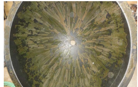
Bio-film on the inside of bio-dome