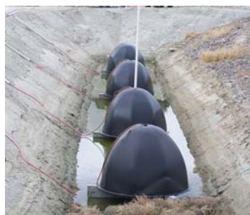
Pilot study bio-dome