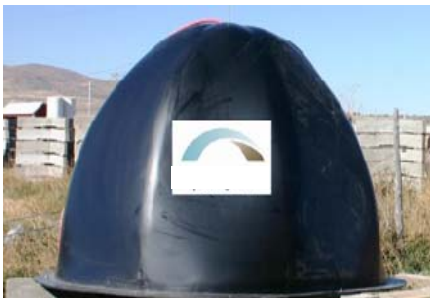
Fully assembled bio-dome

Bio-domes are 6ft diameter, 5ft high, and weighs 850 lbs. Bio-domes are economical, and can be incrementally installed to match the specific needs of a community; whether it is to increase lagoon capacity, extend the useful life of the lagoon, or to help lagoon operators meet regulatory requirements. Installation of bio-domes can dramatically improve lagoon performance and can delay or avoid costly capital expenditures in more expensive solutions.